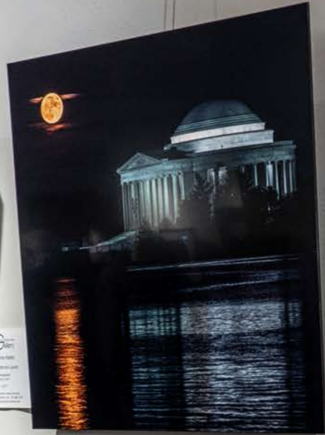
Gallery Sherm Edwards Super Moon over the Tidal Basin 2014 18" x 24"